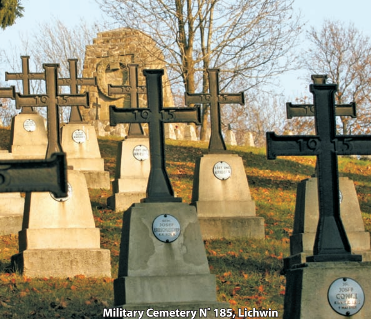
Military Cemetery N° 185, Lichwin