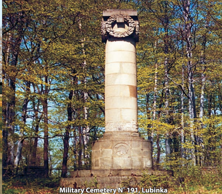
Military Cemetery N° 191, Lubinka